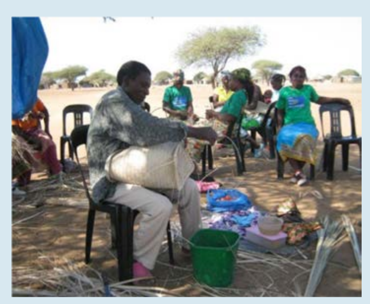
Training animators in handcrafts and building improved barns

Two years later as animator, he started to receive loans from Microfinance and livelihoods program and he applied to many small businesses and agriculture, that allowed him to take